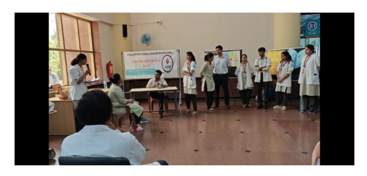
\textit{Figure 7: Skit on Hypertension awareness performed by the students of MBBS, on 17th \textit{June 2024}}\\