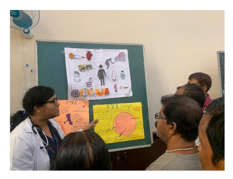
Figure 2: Awareness programme on Hypertension observed on 17th May, 2024