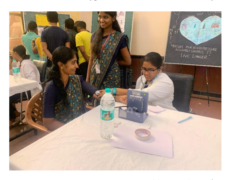
Figure 1: Hypertension screening awareness camp in Vydehi Hospital, on 17^{th} May, 2024

Here are Observations of World hypertension seen on various days of the month.