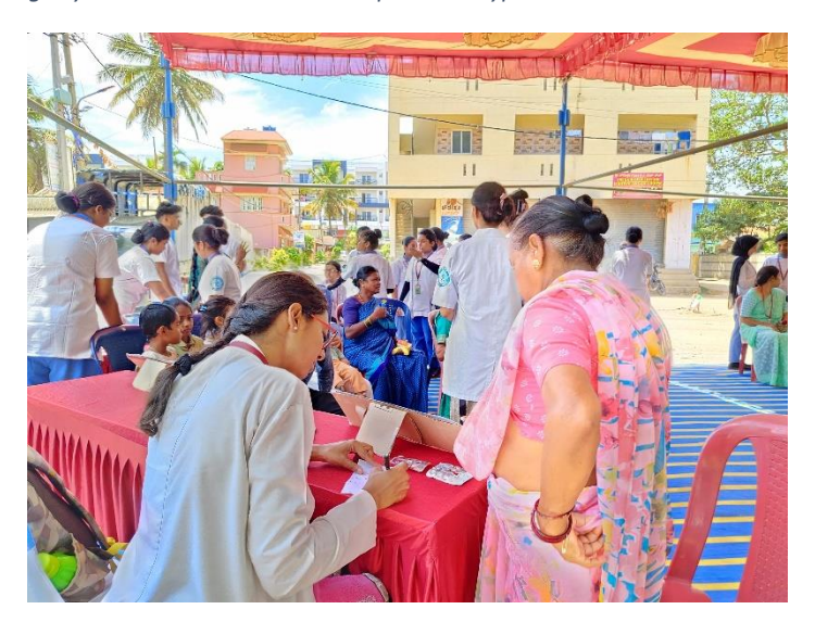
Figure 4: Morbidity camp in Doddabanahalli, observed on 23rd May 2024