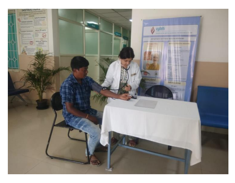
Figure 5: Hypertension screening in Kanamangala camp, observed on 14^{\text{th}} June 2024