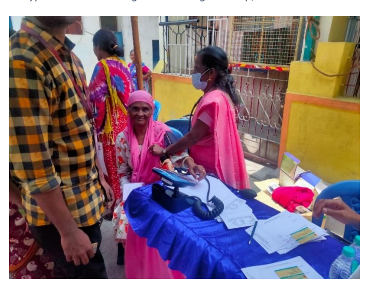
Figure 6: Screening camp and awareness on Hypertension Observed in Lingarajapuram camp, on 15th June, 2024