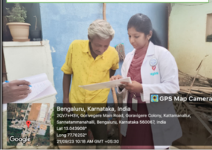
Pharmacovigilance week September 2023: Wallet medication cards distribution